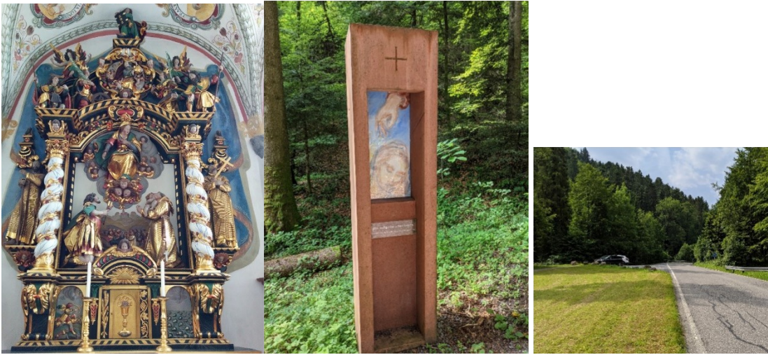
One of the chapels at Hergiswald. Rosary station 1. Car park start of rosary.

Hergiswald Hurch and the Loretto Chapel https://www.hergiswald.ch/ are the most beautiful and historically most important pilgrimage site in Canton Lucerne. The chapel and the church were built 1501 – 1662. More historical and art details will follow.